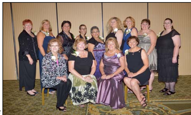
2012-2013 NOMOTC Board of Directors